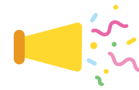
Participate Fully Skill